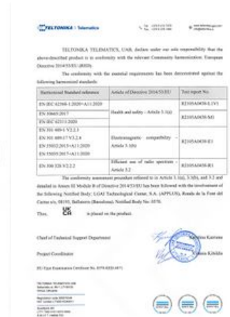
UK Declaration of conformity, BTS page 2

You can the find PDF version of the EC declaration here .