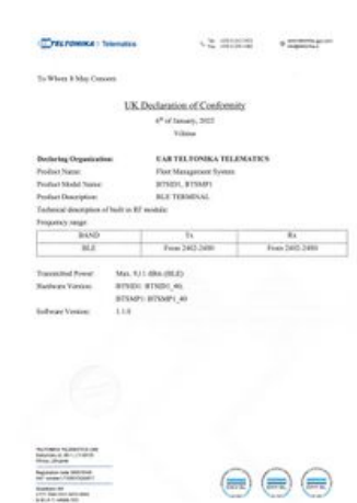
UK Declaration of conformity, BTS page 1