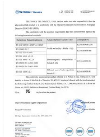
UK Declaration of conformity, BTS page 2

You can find the PDF version of the EC declaration here .