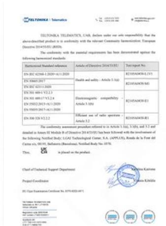
UK Declaration of conformity, BTS page 2

You can find the PDF version of the EC declaration here .