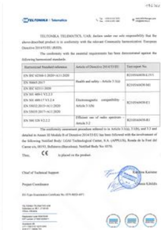
EC Declaration of conformity, BTS page 2