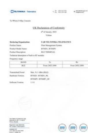
UK Declaration of conformity, BTS page 1