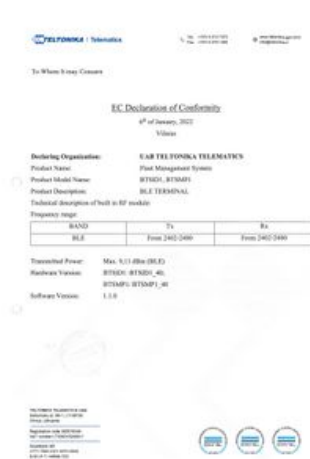
EC Declaration of Conformity, BTS page 1