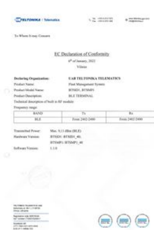
EC Declaration of Conformity, BTS page 1