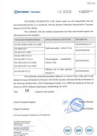
EC Declaration of conformity, BTS page 2