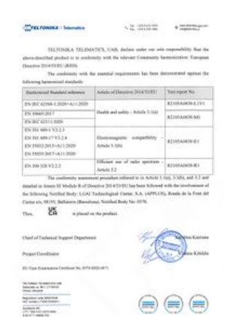
UK Declaration of conformity, BTS page 2

You can find the PDF version of the EC declaration here .