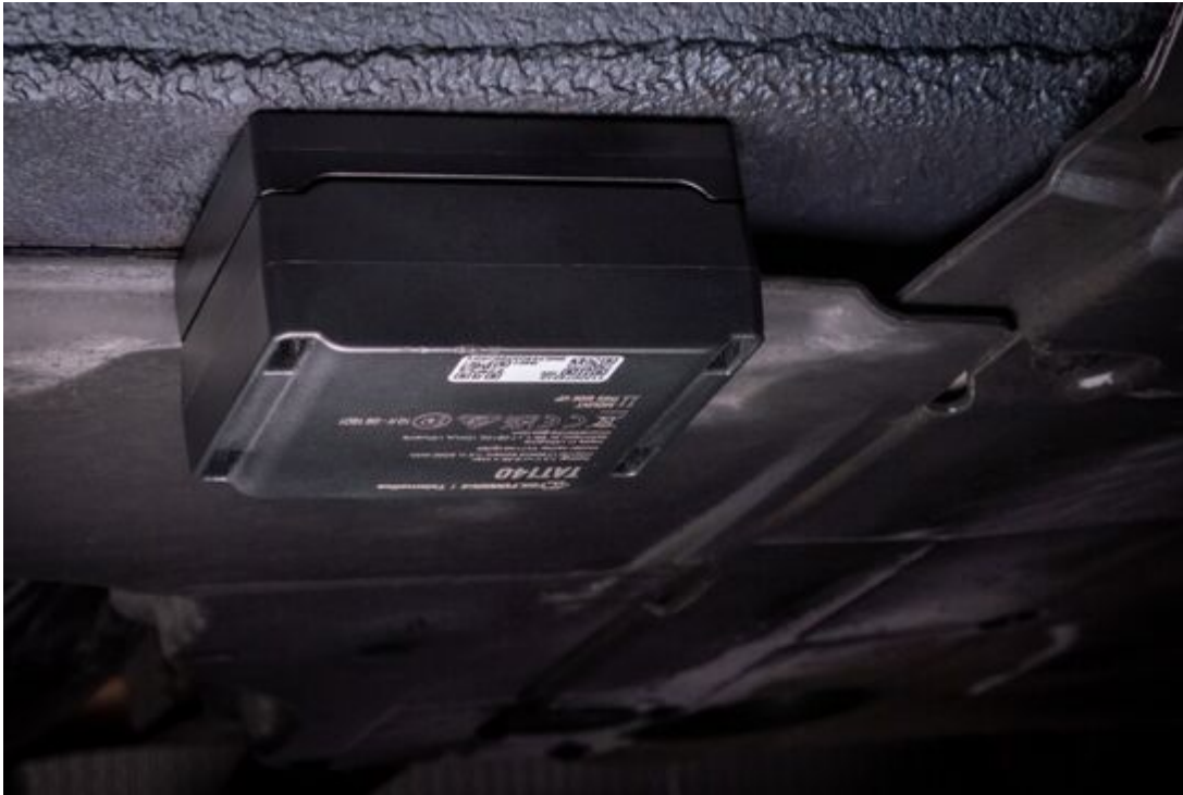
Underneath the car