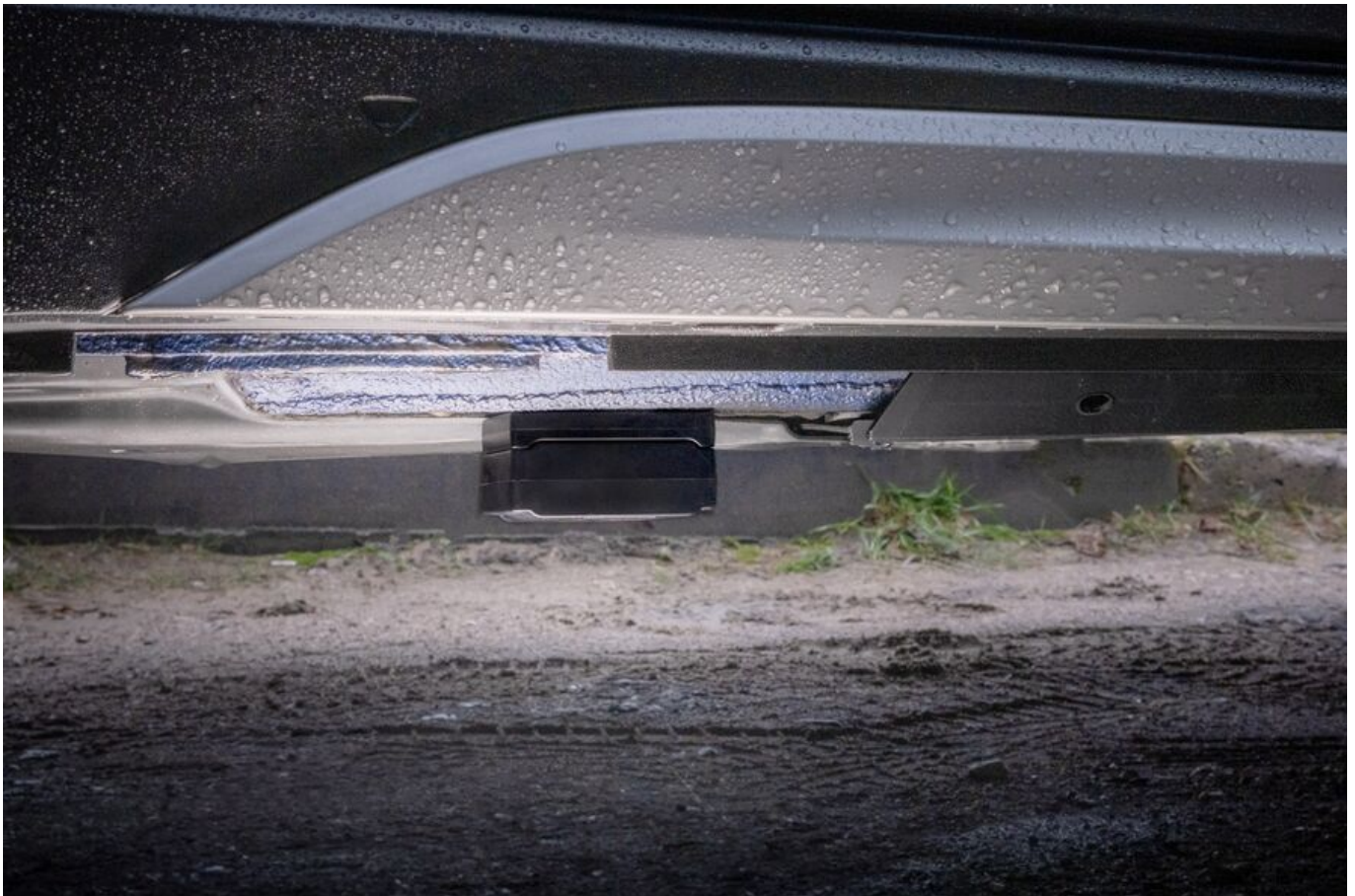
Underneath the car

Understanding these specific mounting places in each category will guide you in strategically placing GPS asset trackers, maximizing their battery life, and ensuring reliable periodic location monitoring.