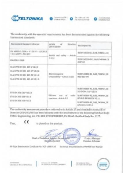
EU Declaration of conformity, FMB964 page 1 EU Declaration of conformity, FMB964 page 2

You can the find PDF version of the declaration here .