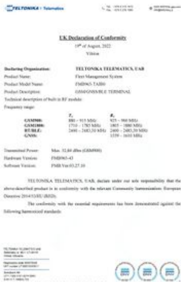
UK Declaration of conformity, FMB965-TAIB0 page 1