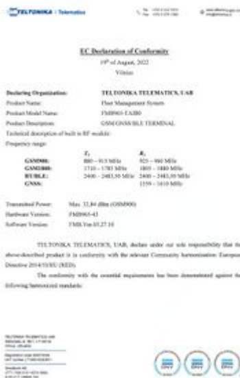
EU Declaration of conformity, FMB965-TAIB0 page 1