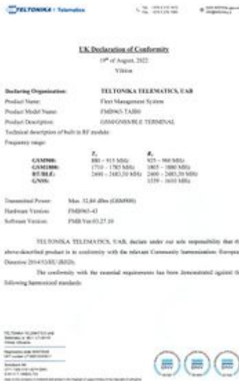
UK Declaration of conformity, FMB965-TAIB0 page 1