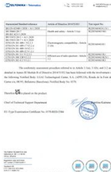
UK Declaration of conformity, FMB965-TAIB0 page 2

You can the find PDF version of the EC declaration here .