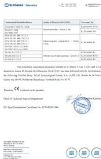
EU Declaration of conformity, FMB965-TAIB0 page 2