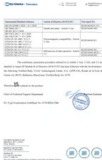
UK Declaration of conformity, FMB965-TAIB0 page 2

You can find the PDF version of the EC declaration here .