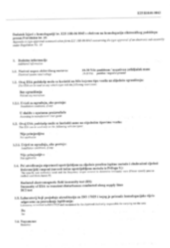
FMC001 E-mark page 3

You can find the PDF version of the certificate here .