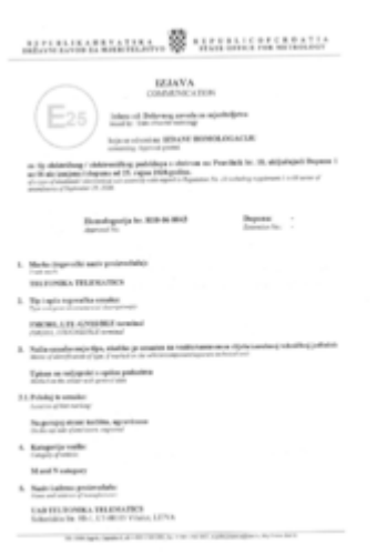
FMC001 E-mark page 1