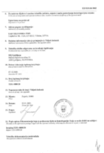
FMC001 E-mark page 2